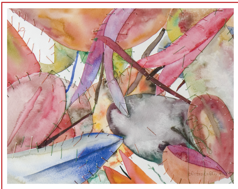
Watercolor and thread on paper 11 x 13 inches