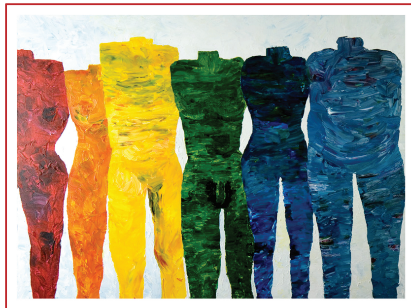
Acrylic on canvas 36 x 48 inches