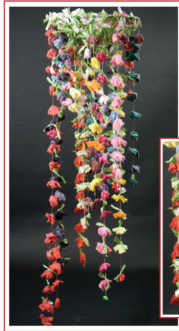
Dyed tampons, metal and thread 20 x 20 x 84 inches