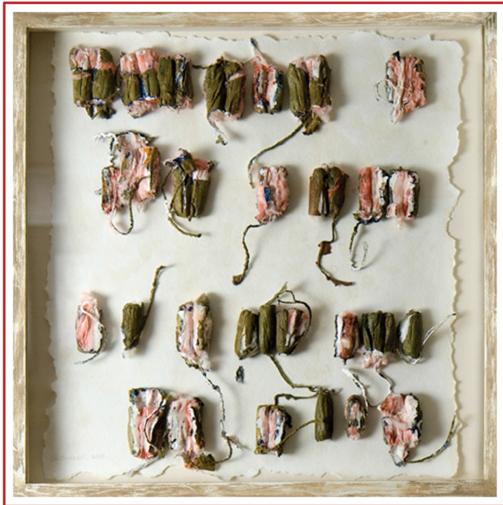
Tampons, acrylic and thread on paper 20 x 20 inches